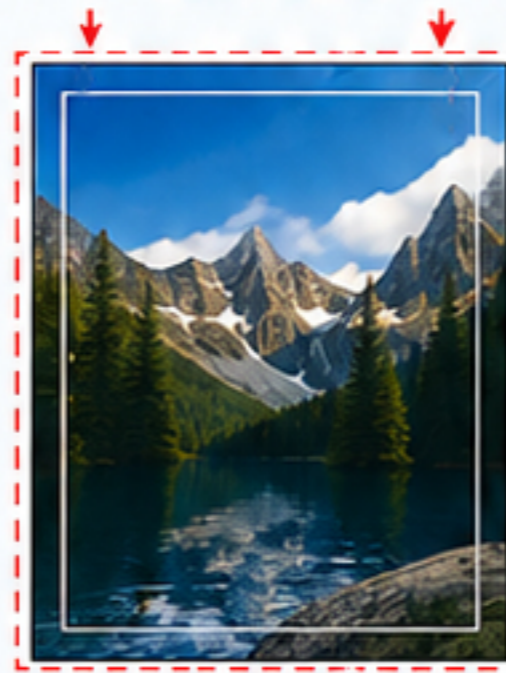
FILE SIZE WITH BLEED 8.75" x 11.25"